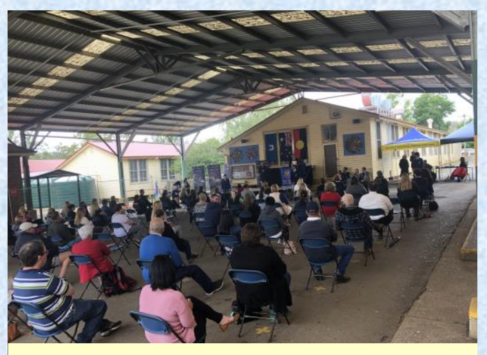
School Presentation Day 2020

Our photography students took photos of each School Improvement Plan (SIP) award recipient with their award. If you would like The School Improvement Plan a copy of your child's photograph, please contact situational analysis is coming to conclusion and we the school.